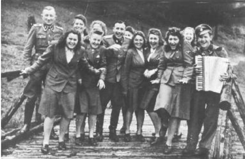
This photograph shows Nazi officers and female guards taking a break from their work at the Auschwitz concentration camp.

when, if one had stood, others would have stood, perhaps, but no one stood. A small matter, a matter of hiring this man or that, and you hired this one rather than that. You remember everything now, and your heart breaks. Too late. You are compromised beyond repair. 10