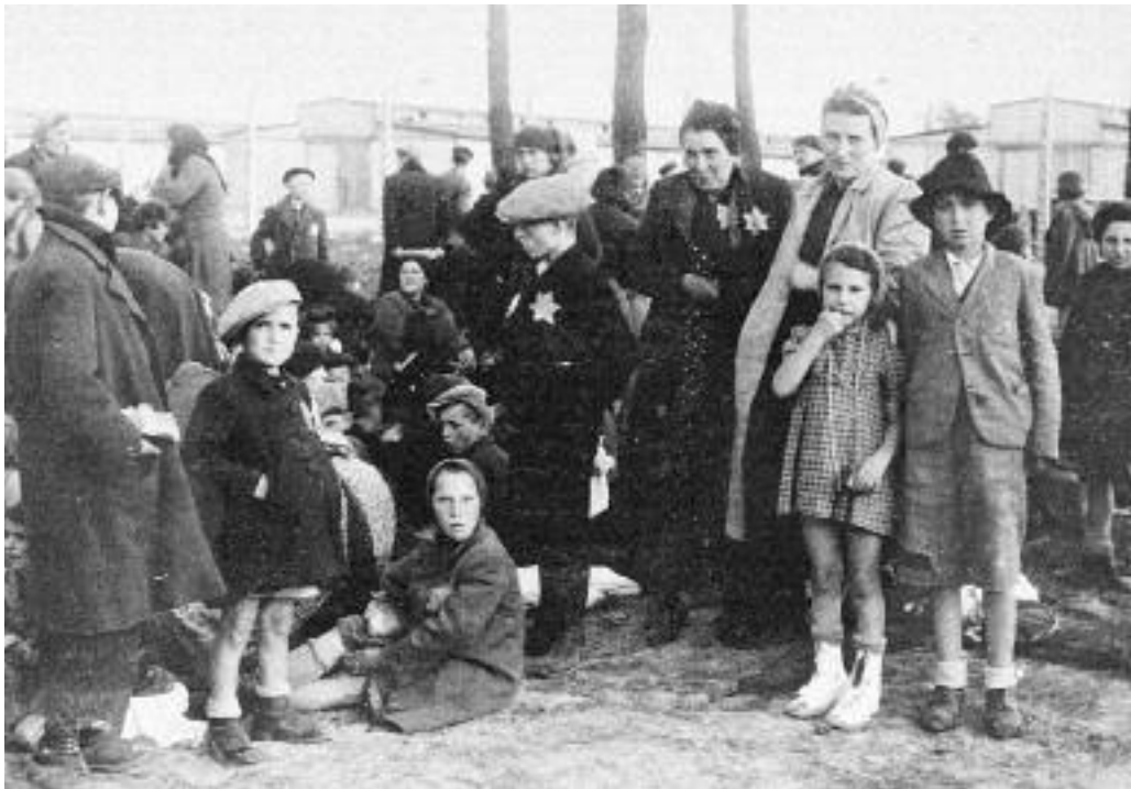
These Jewish women and children have been selected for death at Auschwitz-Birkenau.